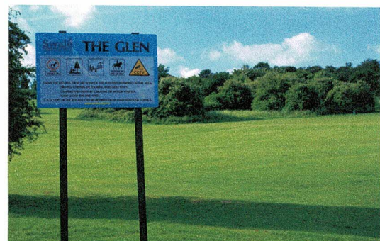
The Glen Village Green